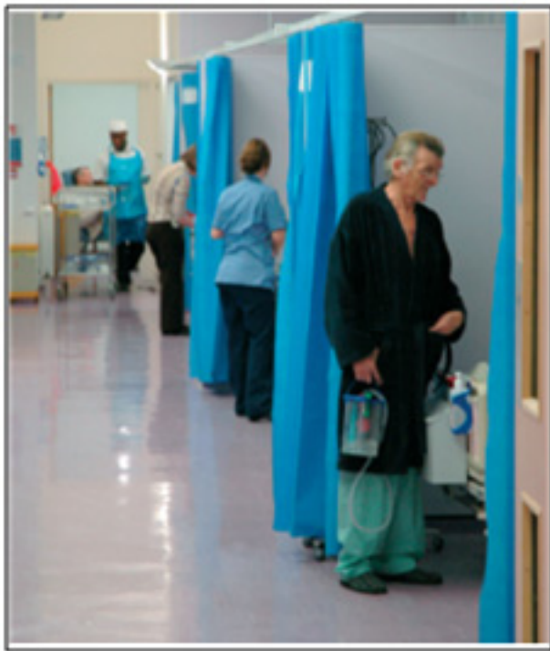
Figure 3: a plastic bag attached to chest drain.