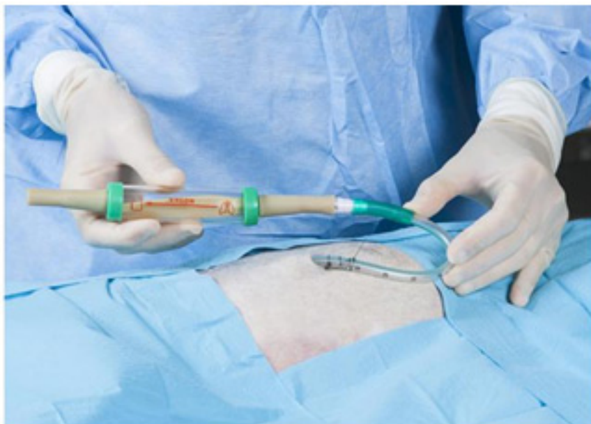
Figure 2: Heimlich valve attached to chest tube